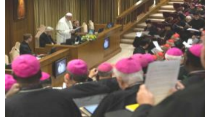
Holy See Press Feb 2019, Vatican City